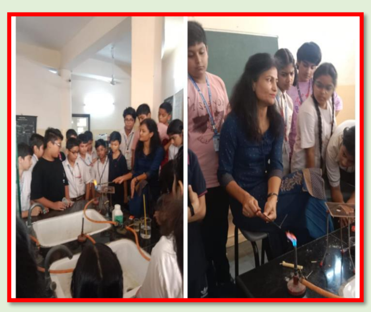
Activity 4 - To show transportation of fluid in plant cells using potato and sweet water. Learning Outcome – Students learnt how the process of osmosis occur in potato through its thin membrane.